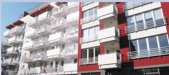
WSEI UNIVERSITY STUDENT HOUSE