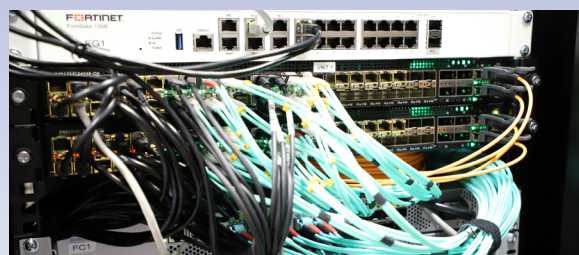
WSEI UNIVERSITY CLOUD