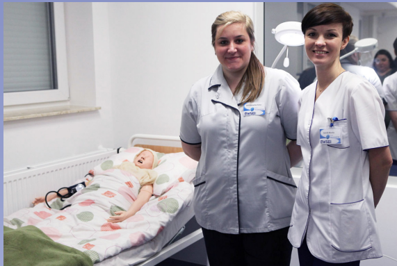
CENTRE OF MEDICAL SIMULATION