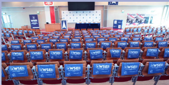
ASSEMBLY HALL E